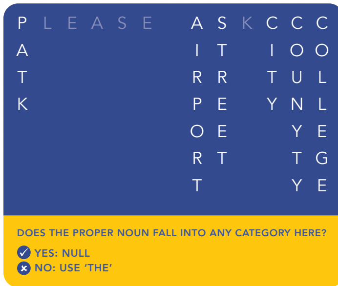
► FIGURE 1: Please ASK heuristic categories.